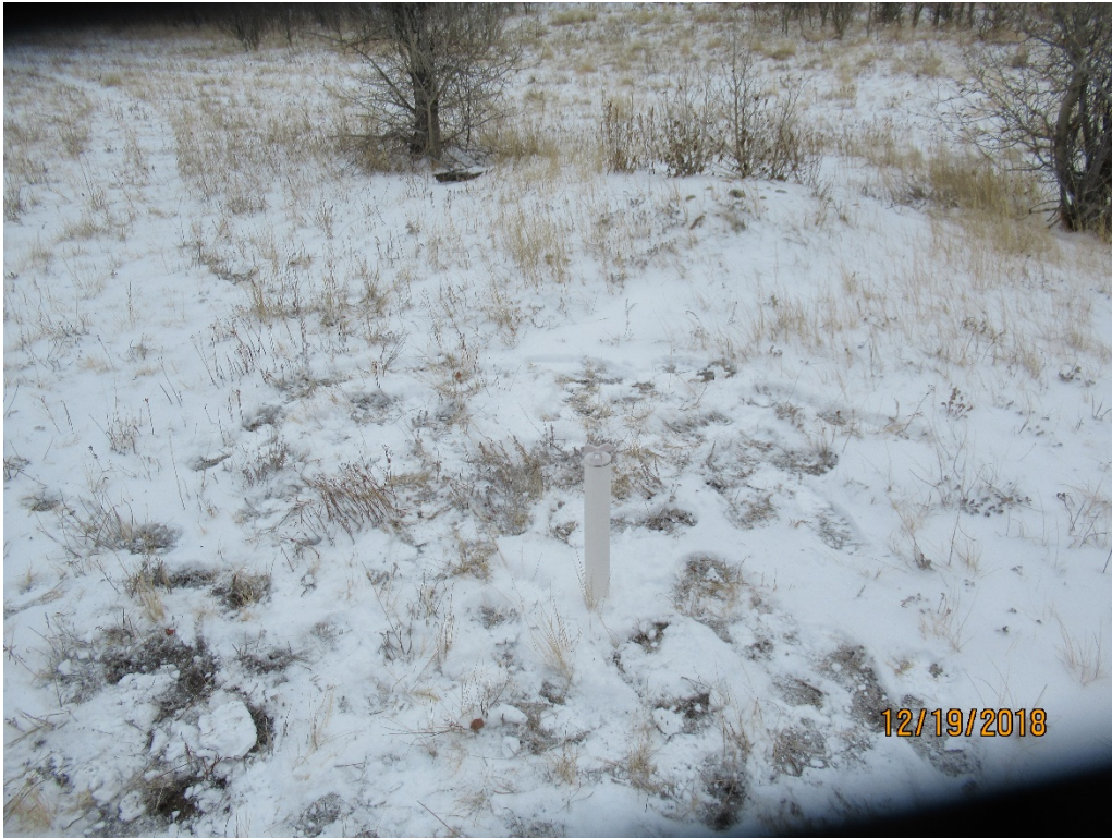
View of TH-5