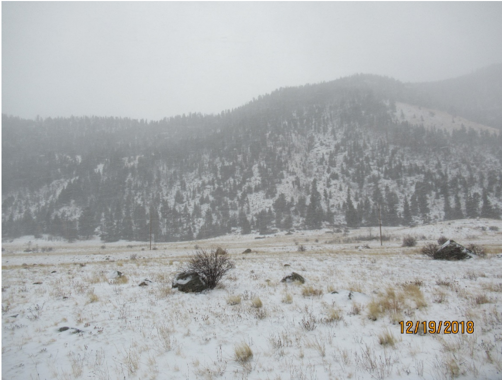
View of the site from the northeast corner looking south

Ben Langenfeld Empire Aggregate, Inc. 1935 65th Avenue Greeley, CO 80634