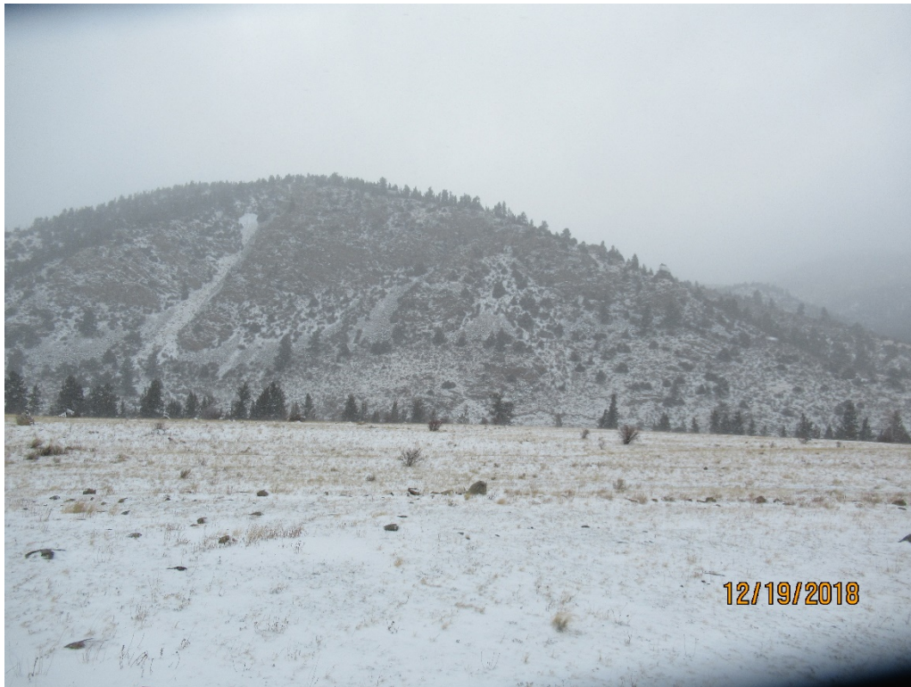
View of site from approx. location of TH-2 looking north