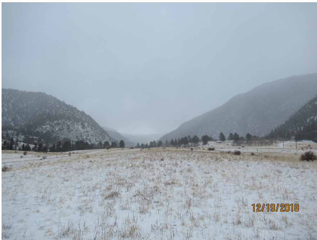
View of the site from the west side looking east