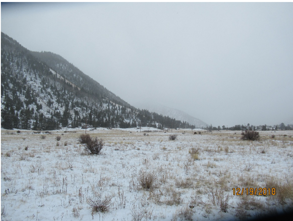
View of site from TH-05 looking west